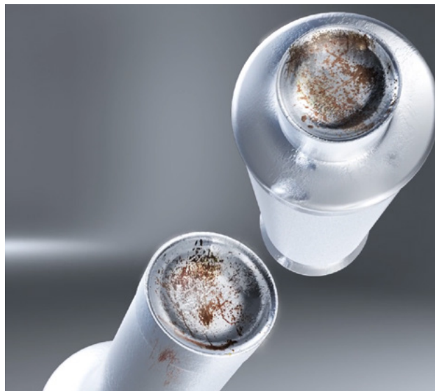
Corrosion on tablet tooling can delay production, reduce efficiency and cause contamination problems.

Traditionally, electro-plated hard chromium was the most popular coating used within the tablet tooling industry, but it has many disadvantages. When hard chromium is applied to tooling, a certain amount of hydrogen penetrates the substrate, which can decrease the steel's working load by up to 20%. To counter this effect, the plated tools undergo a baking process known as de-embrittlement that reduces but does not eliminate the unwanted characteristic. It is also subject to micro-cracks which can develop during the plating process when the internal stress exceeds the tensile strength of the chromium. These micro-cracks are problematic because they provide a porous route to the substrate that will allow granule or cleaning solutions to attack the steel beneath.